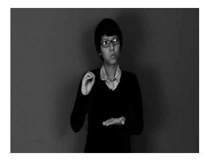
Fig. 1. Không có điểu kiện (translation: "lacking the [typically, economic] conditions for X")